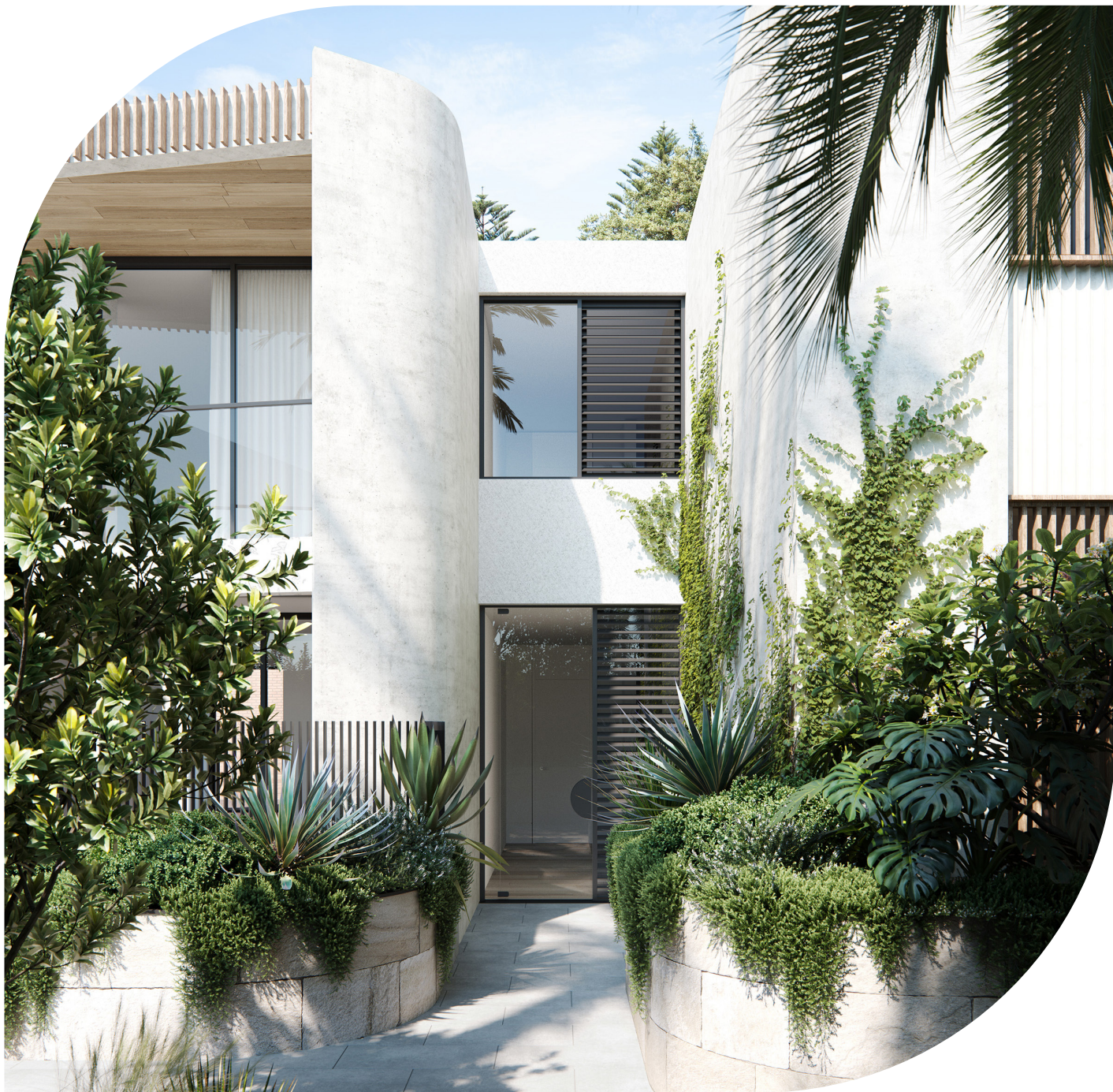
Iluka by IPM Property & PBD Architects