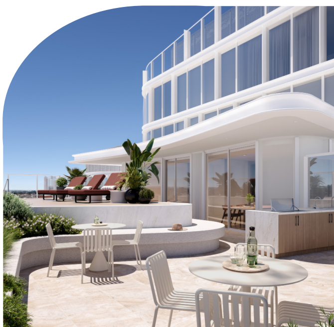
AURA by Aqualand

At Ethos Urban, we're a team of economists, planners, designers, social strategists, engagement specialists and project managers. We approach our work and play with the curiosity, and the imagination, to solve problems and make the impossible, possible.