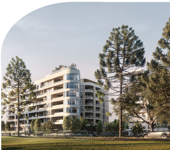
Aire by Sekisui House & The Orchards Norwest

Altus Group is a leading provider of independent advisory services, software and data solutions to the global commercial real estate industry. They empower clients to analyse, gain insight and recognise value on their real estate investments.