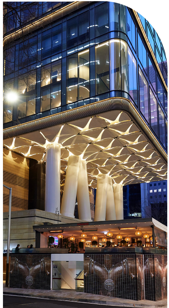
88 Walker By Billbergia

10% off the full course fee for groups of 4+ available for UDIA NSW members